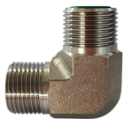
SAE/ORB Male x ORFS Male 90° Elbow