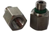
Male x NPT Female