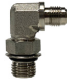
37° Male x SAE/ORB Male 90° Elbow